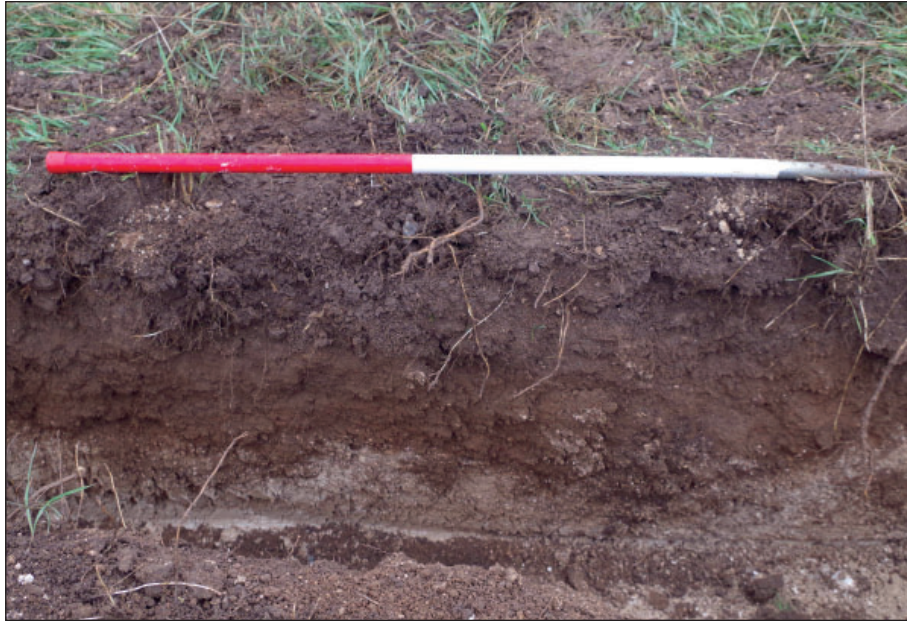
Figure 4: West Facing representative section 3, 1 m scale