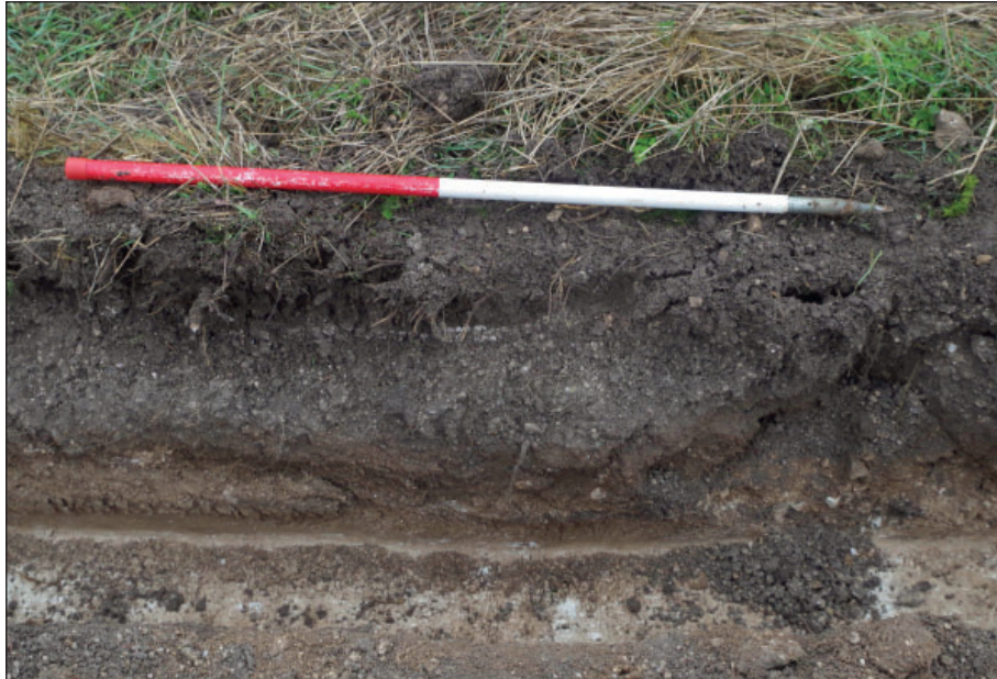
Figure 5: West Facing representative section 4, 1 m scale