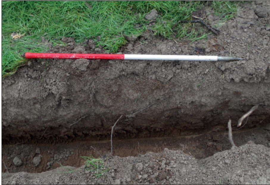
Figure 2: North Facing representative section 1, 1 m scale