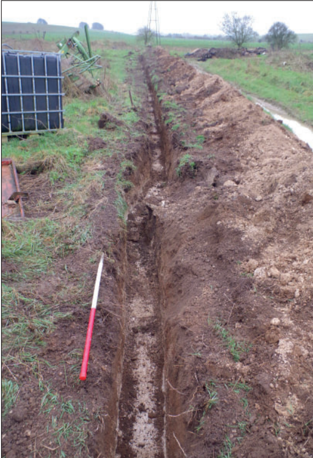
Figure 6: Trench 1 view South, 1 m scale