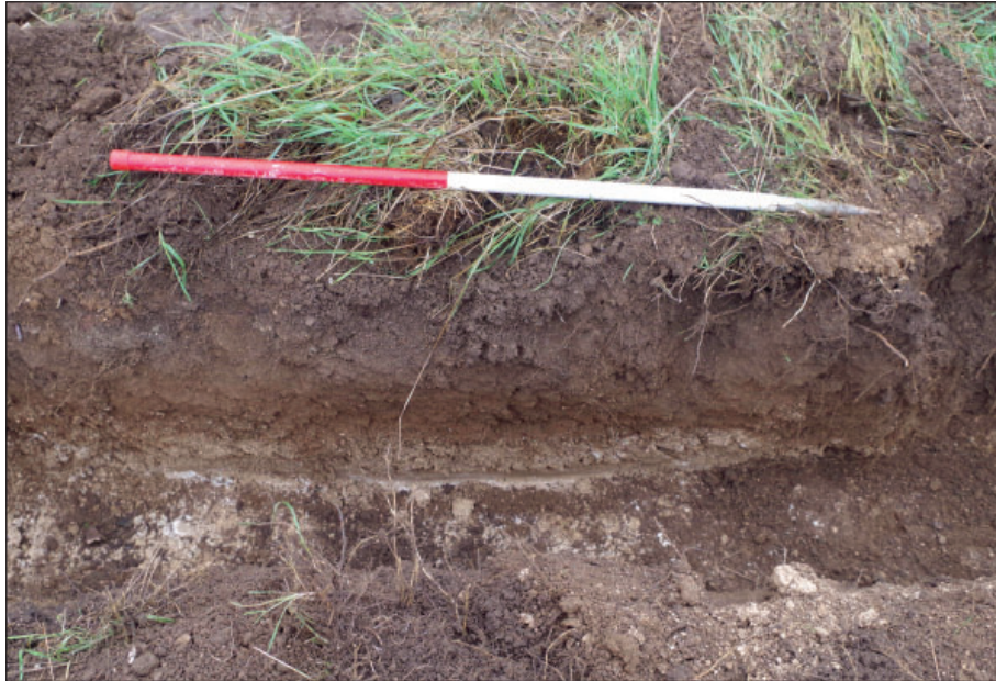
Figure 3: North-West Facing representative section 2, 1 m scale