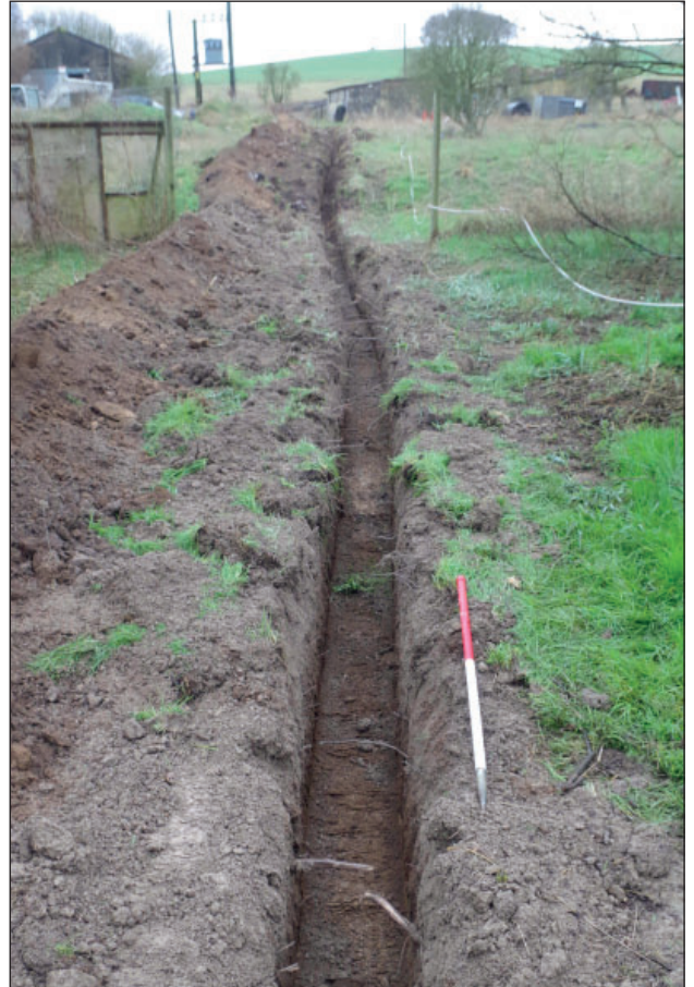
Figure 7: Trench 1 view East, 1 m scale